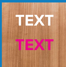
White Layer - Print File

No ink will be printed for any object in the artwork set to white, and the colour of the substrate will be seen.